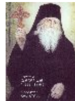
Fr. Cleopa - painting from his memorial cell (15)